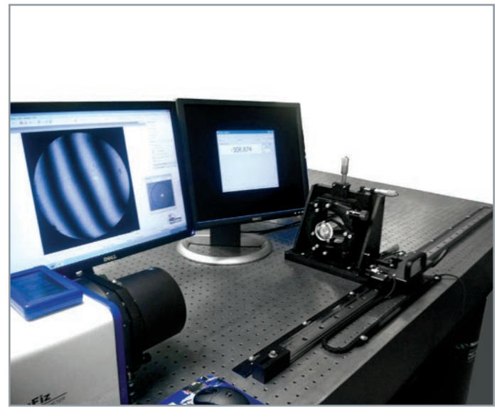
Linear Encoder based Digital Radius Slide.

* Factors such as setup, atmospheric conditions, thermal expansion, optics thermal drift and dead path error will contribute to overall system uncertainty.